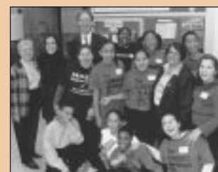
Top: Ribbon-cutting at the opening of the PASE Learning Lab at the Community School on January 28th.