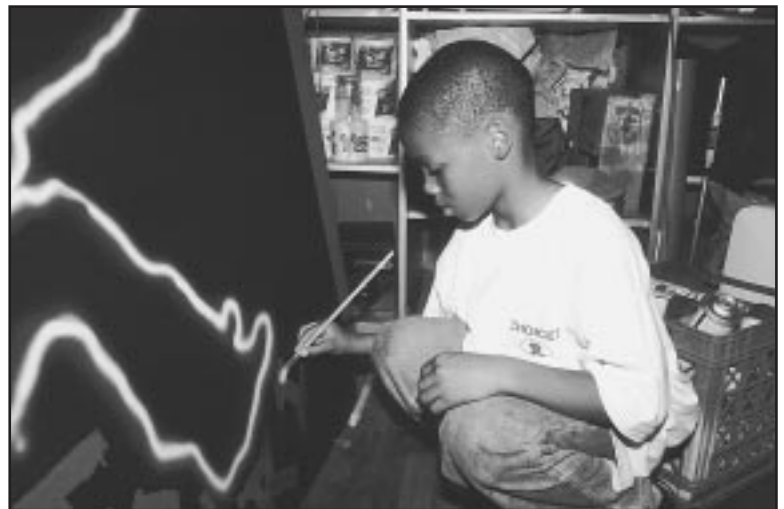
Participant in the Community-Word Project at New Settlement Apartments

CBO's are, in many ways, less bounded than schools and, albeit with some constraints, are places for free expression. Standards