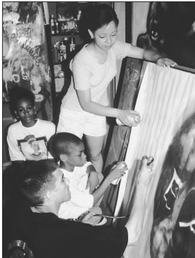
Participants in the Community-Word Project at New Settlement Apartments

Every child who has participated in a Community-Word Afterschool residency knows the meaning of collaboration, the common thread that runs through everything we do. Our staff models it by team-teaching and working closely with our assistants, our lesson plans always include group work, we integrate different artistic disciplines such as writing, drama and visual arts into each session, and lastly our culminating project, a team-painted mural, features a line from a collaborative poem. The combination of collaboration, creative expression, and creative writing results in improved self-esteem and literacy/communication skills and provides a wonderful way of getting young people to enjoy the difficult task of articulating their ideas into writing. Inspiring young people to create art