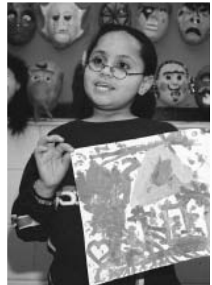
A young girl shows off her artwork at Henry Street BGR.

There are, nonetheless, many dimensions of children’s developing selves that cannot be tied so closely -- or at least exclusively -- to the demands and opportunities found in school. Some of these involve capacities that teachers (and other school staff) lack the time or incentive to help nurture. Some involve tasks that may be more central or find different expression (or take different form) outside of school life. And some involve qualities of self that may even be antithetical to what is needed or nurtured in school, or that school experience actively undermines in particular groups of children.