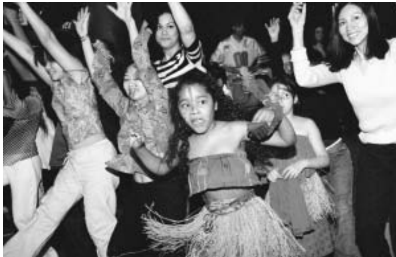
Youth and practitioners dance at PASE's citywide Youth Expo for young people in afterschool programs.

Afterschool programs are supportive of the social and interpersonal dimensions of children's development. Their activities are full of children sharing, collaborating, helping each other, working and playing together.