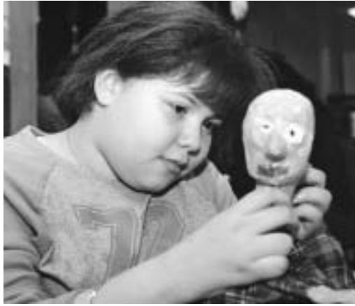
A young girl creates a puppet at Henry Street BGR afterschool program.

trying to accomplish, and why they do what they do (i.e. the theoretical rationale for the over-all design, particular use of time, daily and weekly content of activities in their programs, staff skills and qualities sought, framework for adult-child relationships in their program, etc.). Providers and programs included in a typical multi-site study often vary in mission, focus, emphasis, and structure. The nature and quality of children's experiences in afterschool programs are widely variable, even in initiatives with some focus on program quality. 5